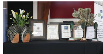
A lifetime of achievement brings awards and rewards.