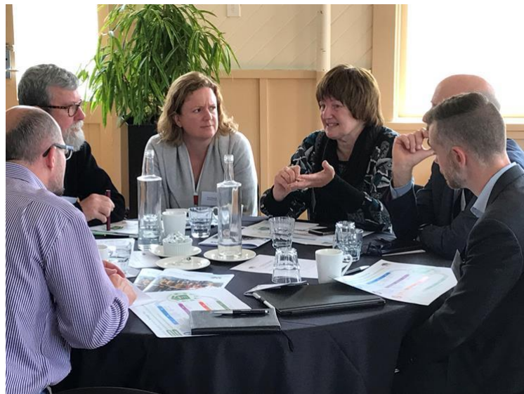
Members discussing the proposed Strategic Plan during the pre-AGM workshop.