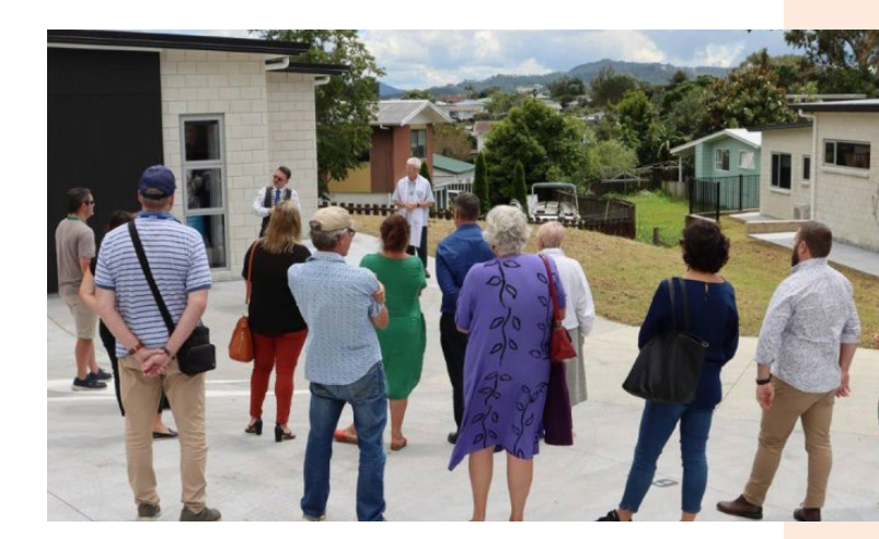
Habitat for Humanity Northern Region -Affordable Housing launch, Onerahi Whāngarei

"These new homes provide security of tenure, a healthy living environment, and stability for each family that will have long-term benefits. We cannot do this by ourselves, which is why partnerships such as this one are critical to providing solutions to the current lack of affordable housing in Whangārei."